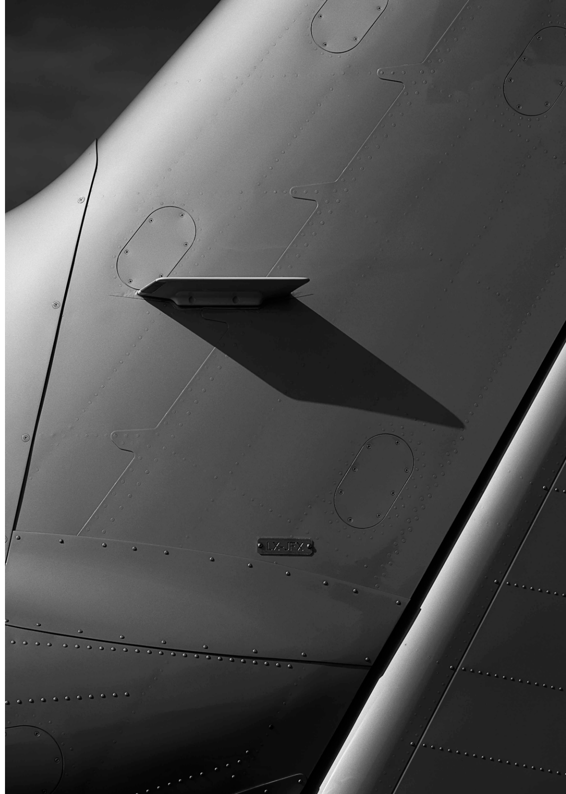
ABOVE + RIGHT: JETFLY 12 + 09