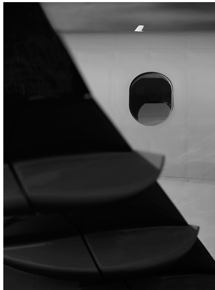
ABOVE + LEFT: JETFLY 06 + 10